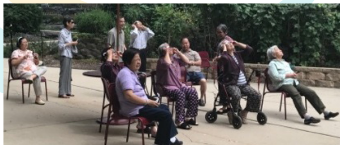
Residents at Greencastle of Barrington

Many residents and staff stepped outside to view the eclipse on August 21st. Greencastle of Barrington had a celebration potluck lunch while learning about eclipses. Residents reminisced about eclipses they had seen or heard about from other family members. There are ancestral tales of a dragon, dog, black squirrel, pair of wolves or an ancestor who is owed money swallowing the sun. Thanks to Cernan Earth and Space Center at Triton College, we were able to get certified solar eclipse viewing glasses. Despite the clouds, we were able to see much of the eclipse safely. We did not see any animals swallowing the sun however! Lots of OHHS, AHHS and fun!