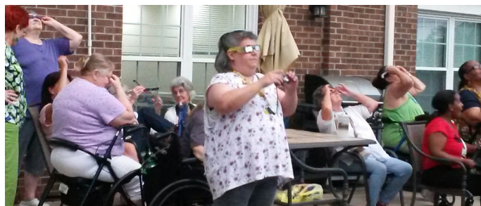
Residents at Bethel Greencastle North & South

Residents at Bethel N & S had eclipse viewing glasses and shared them with those who did not have them. There were probably more residents outside at one time than ever before. We were fortunate to be in the path of nearly 100% coverage and it was pretty incredible.