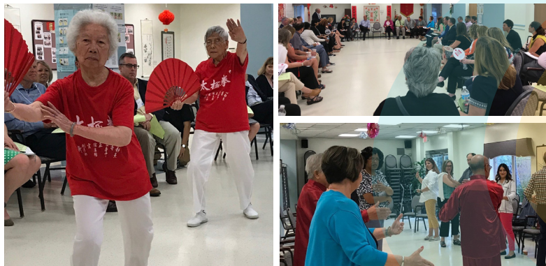
LeadingAge Leadership Program Participants at CASL

On July 12, 2017, over 50 leaders, who are a part of the LeadingAge Leadership Program from all over the United States, visited Chicago's Chinatown for the first time! They were warmly welcomed by the CASL employees, as well as several leaders from Embrace Living Communities.