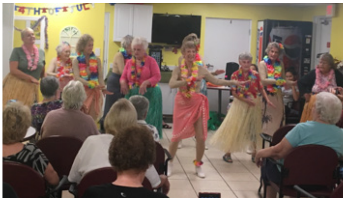
Local Senior Dance Troupe entertaining residents at Greencastle of Bayonet Point

We started the celebration with a senior dance troupe, compiled of all local seniors, who have been dancers through out their lives, three of them are our residents. They always put on a great show and incorporate our residents into the dance routines. It is always a fun activity for all of our residents. The residents continued the celebration by playing games, having a squirt gun "fight", cooking out, etc. All in all it was a great day.