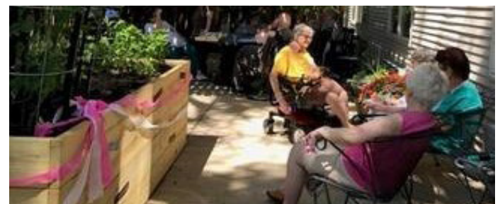
Garden Party at Greencastle of Bienterra

A "Welcome to Our Garden Party" celebration was held on July 20th at Greencastle of Bienterra. Residents celebrated on the patio and enjoyed the blooming flower pots and vegetables that were planted by our residents. They had ice cream bars and cookies that were made by one of the residents.