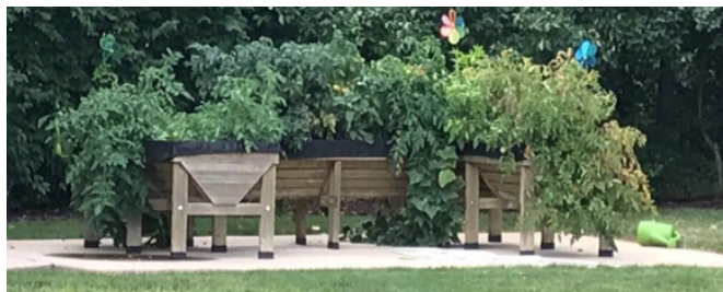
Greencastle of North Aurora