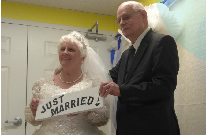
Wedding at Greencastle of Bayonet Point

On July 27, 2017, Greencastle of Bayonet Point had the honor of being the site of a wedding for one of our residents. She is 85, met a gentleman online who is 88, they fell in love and decided to get married. Her dog was the ring bearer. Another resident volunteered to walk her "down the aisle". Other residents got together and supplied "finger" food for a reception, another resident played the organ. There was laughter, dancing, happy crying, a very joyful experience and we are so glad that she decided to have the ceremony in our community room to include staff and residents.