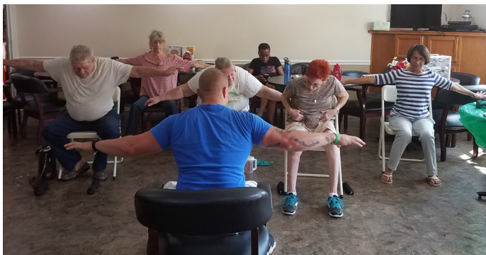
Exercise Class at Bethel Greencastle

The son of a new resident at Bethel Greencastle recently offered to lead exercise classes for residents. He is a certified personal trainer with experience working with seniors and offers simple, strength building exercises that even those in wheelchairs can do. He also shares information on nutrition. The group is meeting twice a week in the north building and we are looking at expanding it to the south building in the coming months.