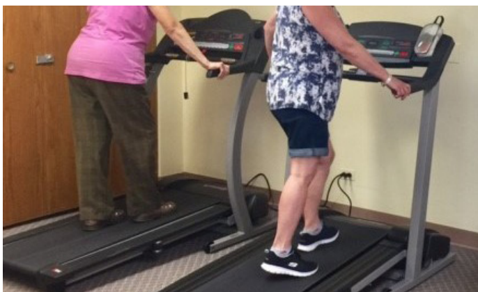
New treadmills at Greencastle of Elmhurst

Greencastle of Elmhurst now has a set of twin treadmills and the residents are thrilled with how their 'workout room' is coming along. Once we pull down the walls and do some decorating in there, we will have a ribbon cutting ceremony!!