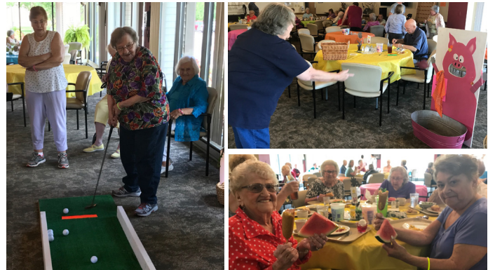
A "County Fair" at Greencastle of Mulford/Greencastle of Allerton