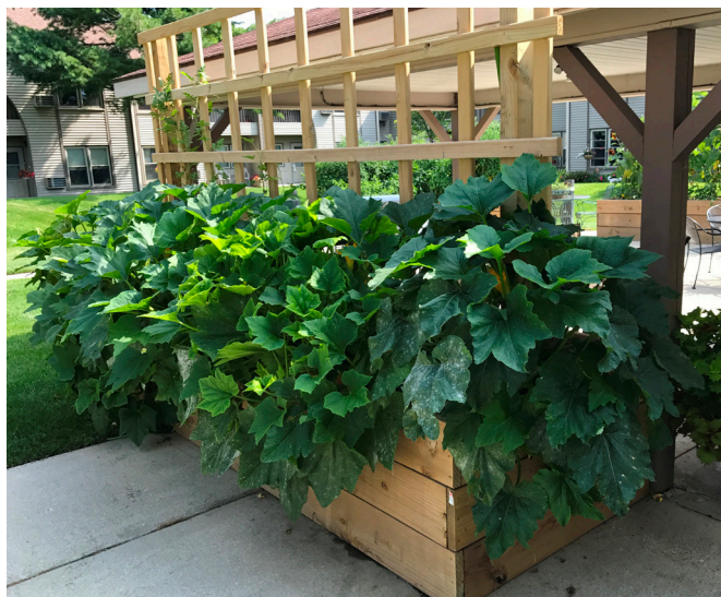
Greencastle of Mulford

Summer has brought bountiful goods to many of our housing communities. Each year we surpass the last with housing communities growing fresh fruits and vegetables in their raised beds, and most communities bring these offerings inside their doors for their residents to enjoy. If you have not already built your beds and planted your gardens, reach out to some of the communities whose pictures are listed below and hear how they did it. It is easier than it looks and the rewards are immense! Enjoy the fruits of our labor.