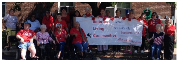
Residents at Bethel Greencastle North & South