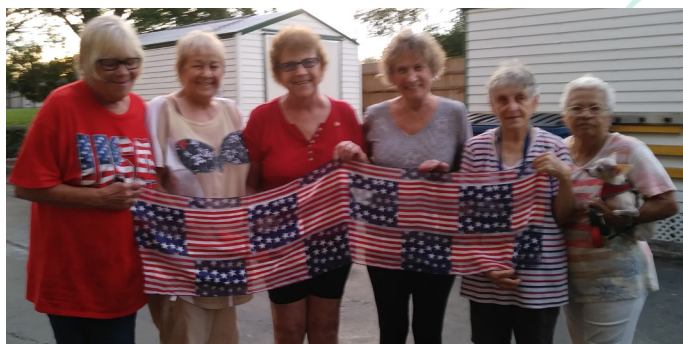
Residents at Greencastle of Bayonet Point

Greencastle of Bayonet point residents celebrated the July 4th.