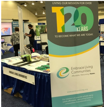
Our booth at the UCC General Synod