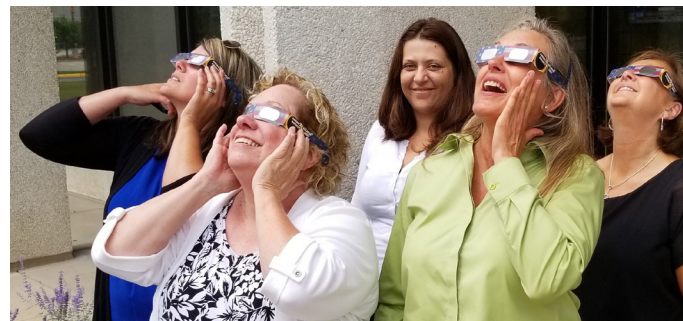
Oak Brook Staff watching the eclipses

Staff at Oak Brook also watched the eclipse. Although a bit cloudy at times, the beginning and end were visible.