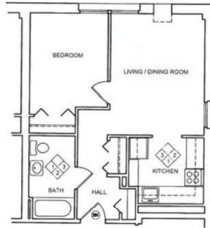
APT. TYPE G ENLARGED FLOOR PLAN SCALE: 1/4"=1'-0" AREA: 524 S.F. NORTH