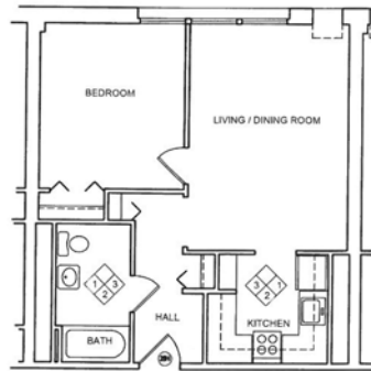
APT. TYPE C ENLARGED FLOOR PLAN SCALE: 1/4"=1'-0" AREA: 575 S.F. NORTH