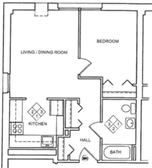
APT. TYPE A ENLARGED FLOOR PLAN SCALE: 1/4"=1'-0" AREA: 524 S.F. NORTH