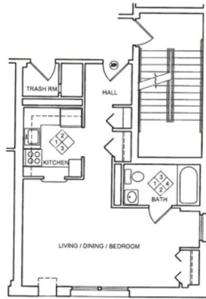
APT. TYPE H ENLARGED FLOOR PLAN SCALE: 1/4"=1'-0" AREA: 494 S.F. NORTH