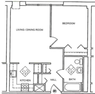
APT. TYPE E ENLARGED FLOOR PLAN SCALE: 1/4"=1'-0" AREA: 512 S.F. NORTH