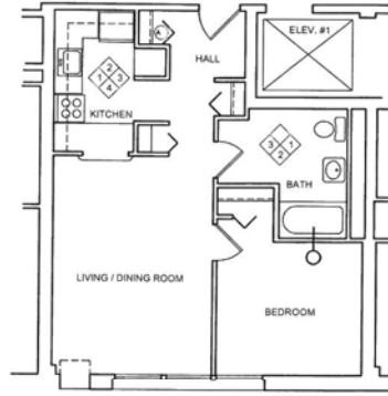
APT. TYPE D ENLARGED FLOOR PLAN SCALE: 1/4"=1'-0" AREA: 546 S.F. NORTH